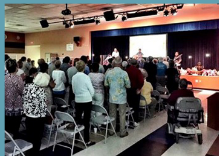
Harvest Bayshore Launch Sunday at Lee Middle School

What a month! In the final weeks and days of preparing for the public launch of Harvest Bayshore, dozens of people gave their time and gifts. In late September, we spent a Saturday morning at local laundromats - with plenty of quarters, hot coffee, and smiles. We had a great time getting to know our neighbors, hearing stories, and sharing laughs. We can't wait to be back in laundromats in the months ahead.