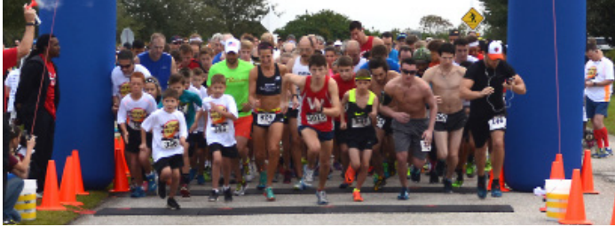
Harvest Hustle 5k 2014

Stacey Gadeken | sgadeken@welcometoharvest.org harvesthustle5k.net